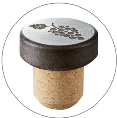
Head laser engraving