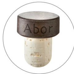
Side laser engraving